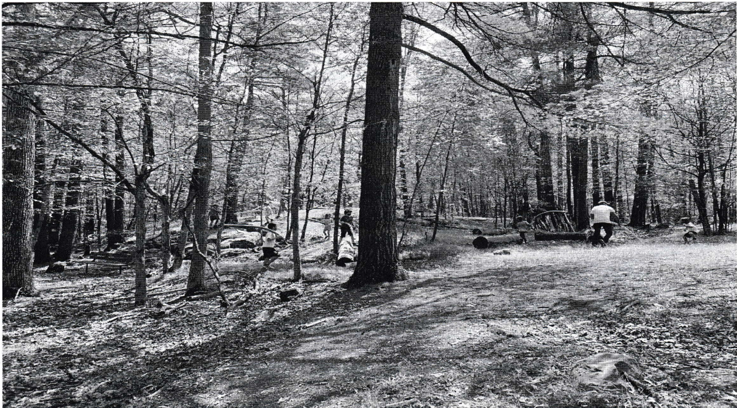
Summer Camp Fun and Games

Memberships are the cornerstone for fund raising. It's through your support that we can continue to fund the programs and projects at Foley Mountain Park. We are hopeful that you will renew your membership when it expires. Thank you for your support.